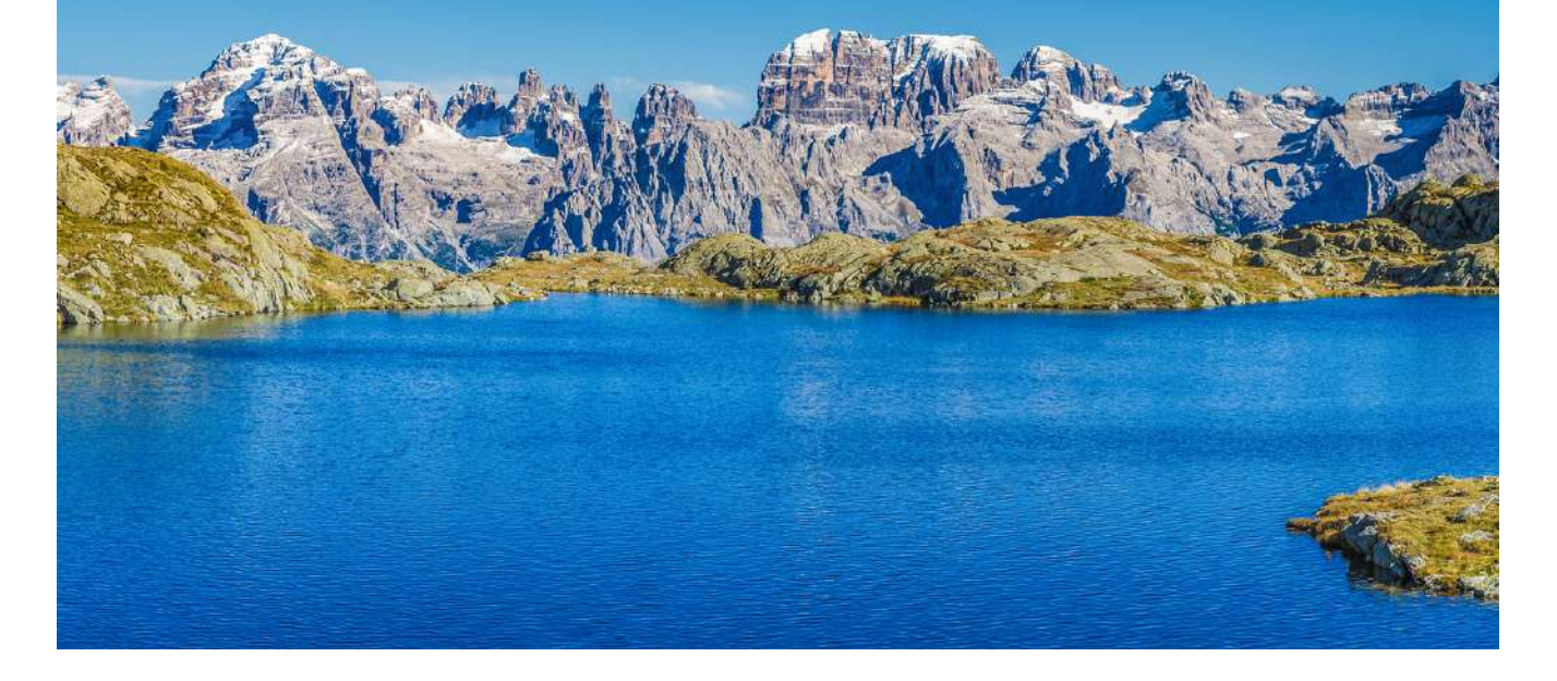
The 3rd edition of The Dolomite Conference on "Global Governance of Climate Change" aims to help jumpstart a change in global dialogue on climate crisis and act as a catalyst for new ideas and offer solutions to 'the single biggest health threat facing humanity'.<sup>2</sup>

The question that the 2024 Dolomite Conference seeks to address is therefore: is there a way to reengage citizens from all generations, farmers, industry leaders and governments in a race against time, to help prevent climate doom whilst ensuring a just and equitable transition for all? Is there a method to transform what is still a "zero sum game" (as for the title of the first edition of the Dolomite Conference) into a win-win strategy that leaves everybody is better off and nobody left behind? Can we transform the huge cost of such transformation into a portfolio of investments with enough and clear economic and social return to be entice private investors and reduce the taxpayer burden? Can we redesign climate policies and the institutions that will implement them to become more inclusive and productive?